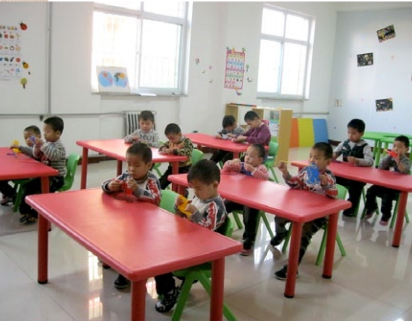
LWB Spain established the Believe in Me Changzhi School in Shanxi Province, which opened in September 2011.

LWB Spain had a wonderful year as they expanded their programs to establish the Believe in Me Changzhi School in Shanxi Province. They also continued their full support of the Tongren foster care program in Guizhou. We all celebrated when LWB Spain won a televised lip dub contest, with the proceeds going to help orphaned children born with cleft lip. Spain maintains their own website, blog, Twitter, and Facebook pages as well.